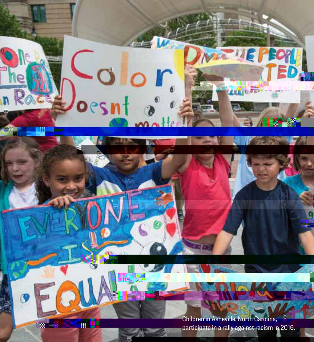
Children in Asheville, North Carolina, participate in a rally against racism in 2016.

with hate experts like the Southern Poverty Law Center. Urge editorial writers and columnists to take a stand against hate.