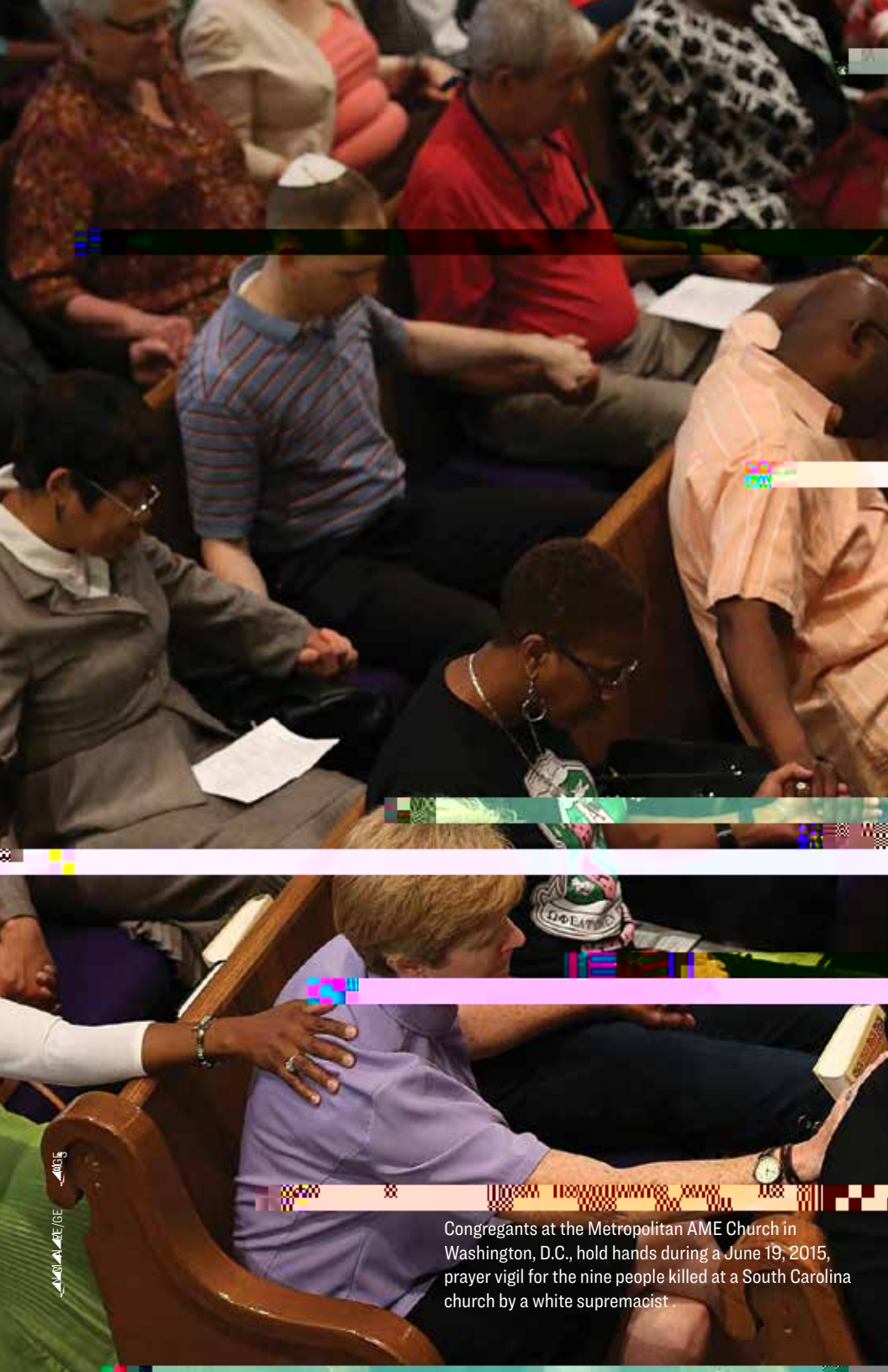
Congregants at the Metropolitan AME Church in Washington, D.C., hold hands during a June 19, 2015, prayer vigil for the nine people killed at a South Carolina church by a white supremacist.